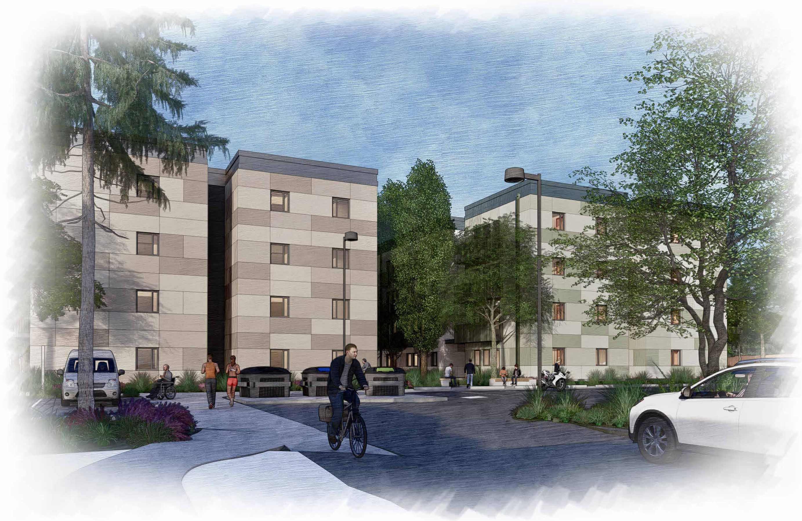
PERSPECTIVE - HILLCREST AVE