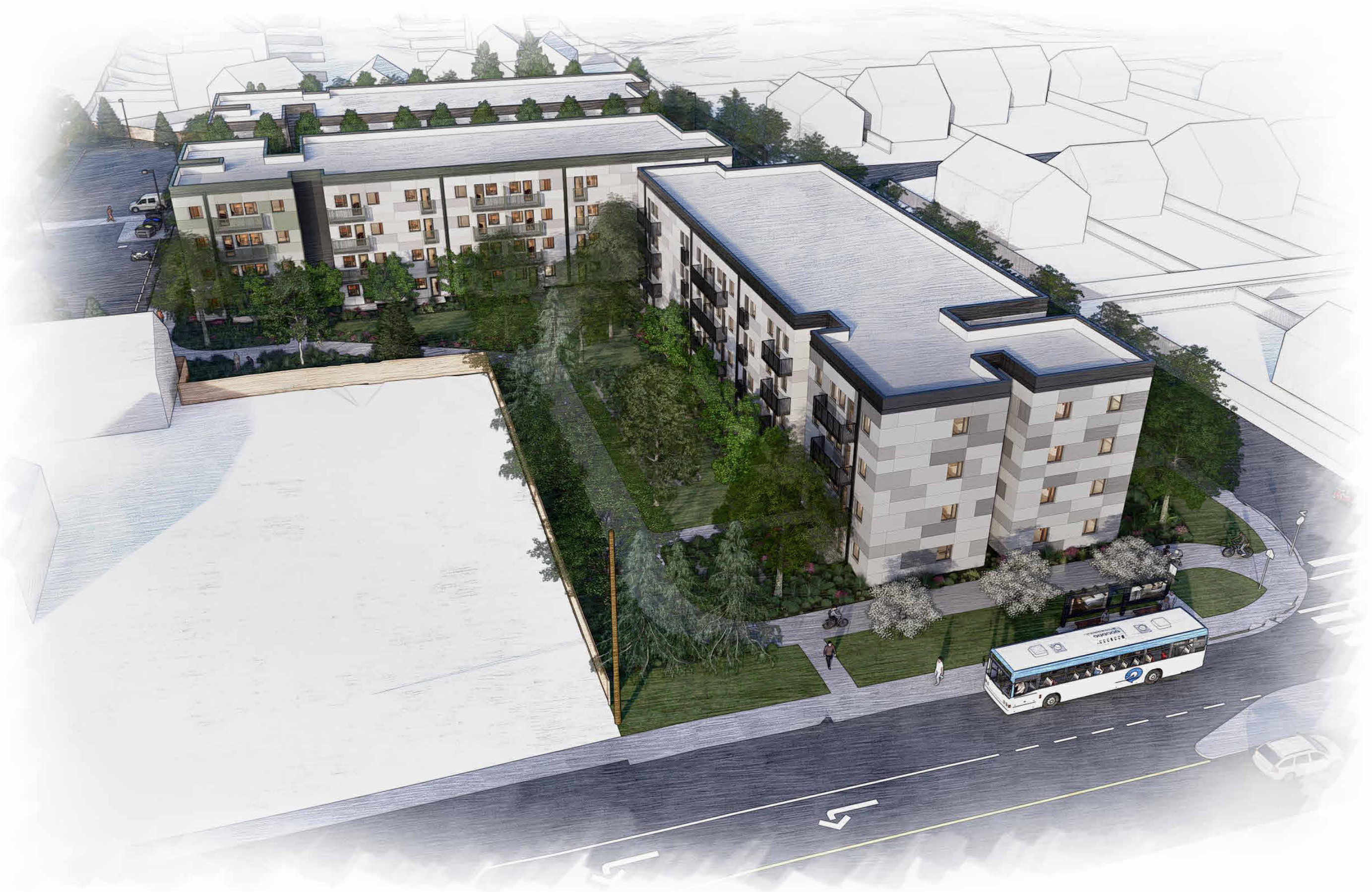
PERSPECTIVE - AERIAL