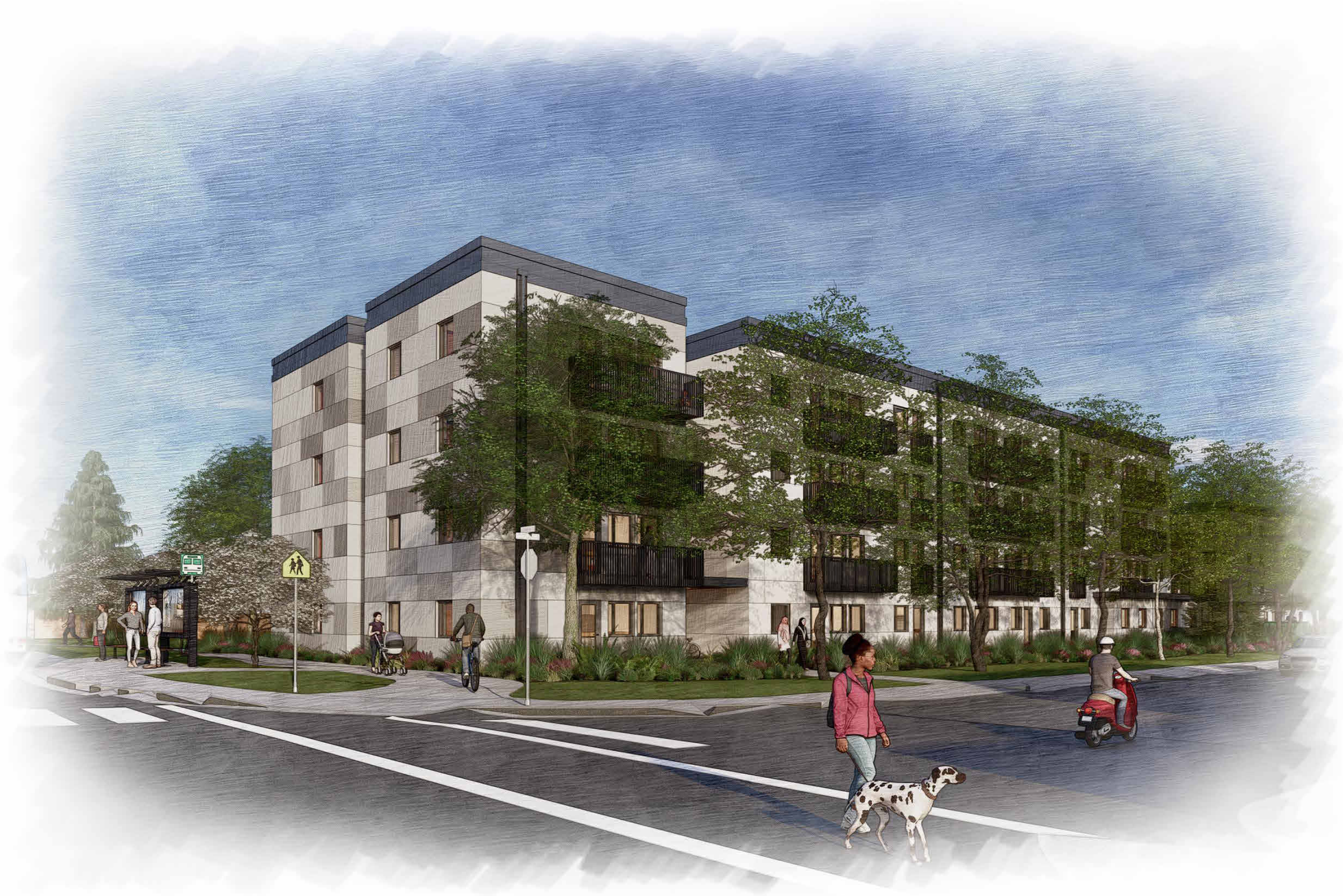
PERSPECTIVE - INTERSECTION