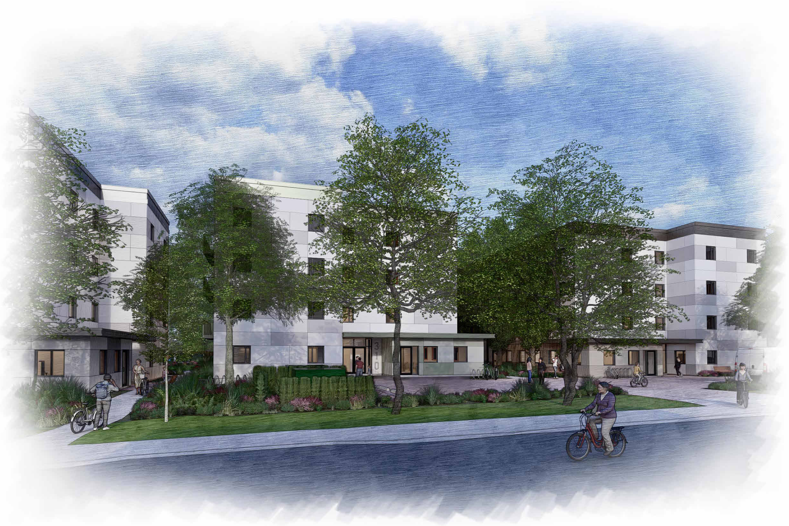
PERSPECTIVE - ENTRY PLAZA